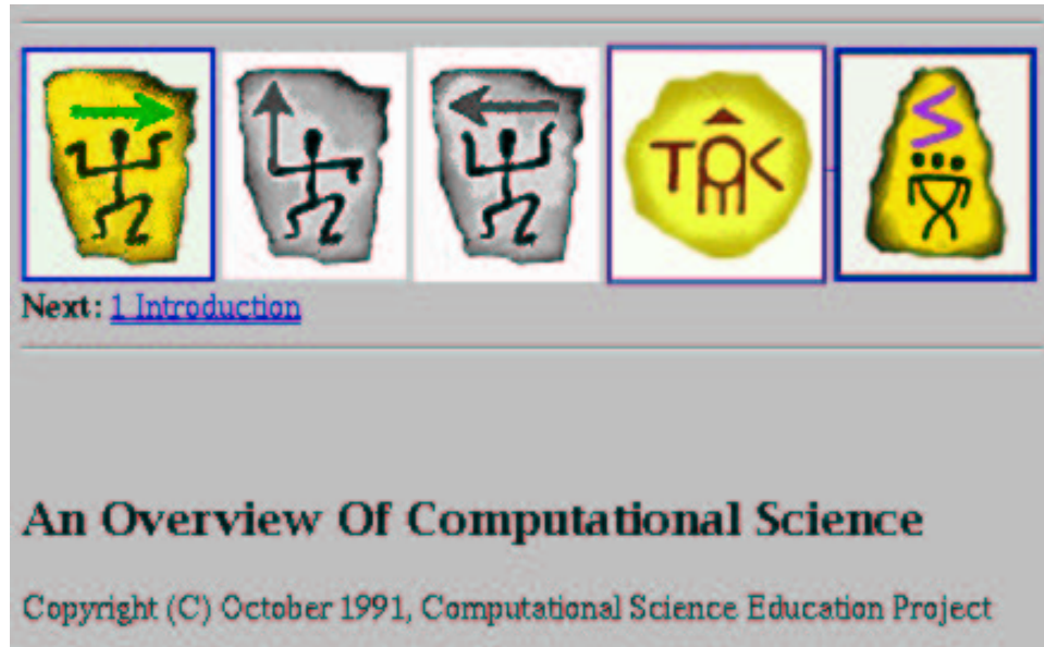
Figure 2: A sample figure showing part of a page generated by \text{\LaTeX}2\text{HTML} containing a customised navigation panel (from the CSEP project 36 ).

\begin{figure} \htmlimage{thumbnail=0.5} \htmlborder{5} \centering \includegraphics[width=5in]{psfiles/figure.ps} \latex{\addtocounter{footnote}{-1}} \caption{A sample figure showing part of a page generated by \latextohtml{} containing a customised navigation panel (from the \htmladdnormallink {CSEP project\latex{\protect\footnotemark}} {http://csep1.phy.ornl.gov/csep.html}).}\label{fig:example} \end{figure} \latex{\footnotetext{http://csep1.phy.ornl.gov/csep.html}}